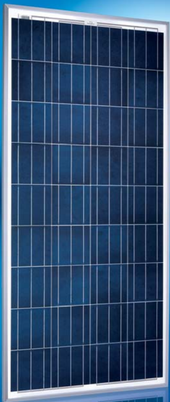
Sunmodule® SW 120 poly/R6A