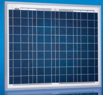
Sunmodule® SW 40 poly/RGA