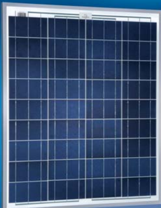
Sunmodule® SW 60 poly/RHA