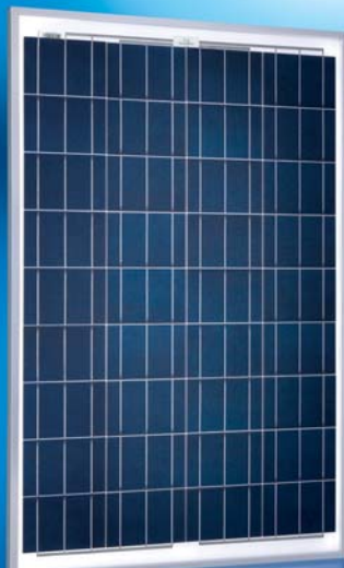
Sunmodule® SW 80 poly/RIA