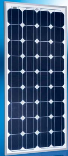
Sunmodule® SW 80 mono/R5A